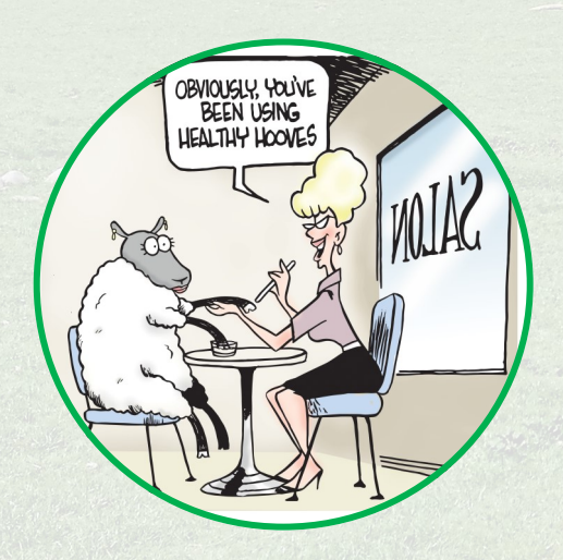
Fast acting, Easy to use & Safe

Proven in field-trials on farms, Healthy Hooves Eco<sup>™</sup> has shown to provide a an effective footbath life throughout the processing up to 800 ewes per 100 litre footbath.